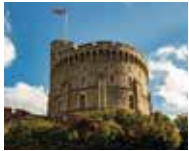
Royal Windsor Steam Train and Sunset Walk with Dinner