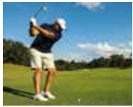
Golf and Hainault Forest Hike