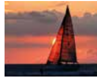
Cruises on the Maldon Black Water Estuary

To book your experience visit www.chigwelltours.co.uk or SCAN the QR Code