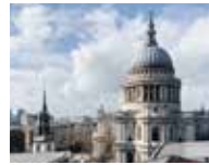
London Masonic Mystery Tour

Explore the Best of England from London's Doorstep!