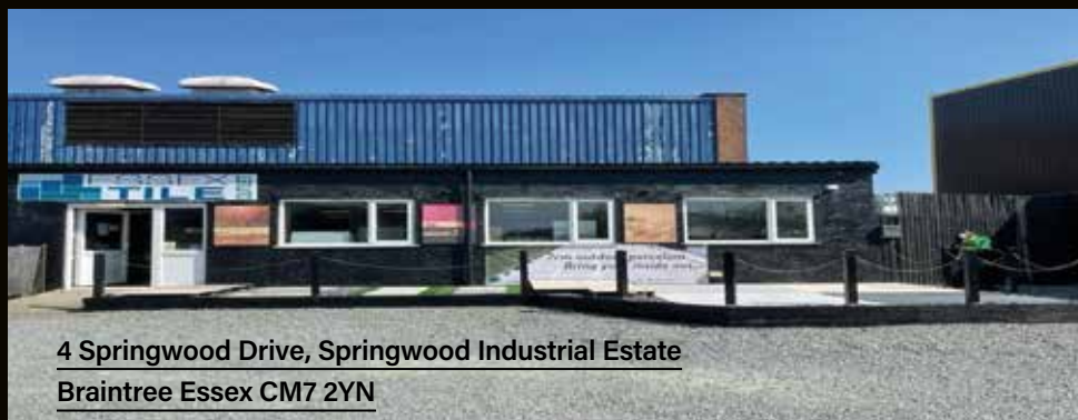
4 Springwood Drive, Springwood Industrial Estate Braintree Essex CM7 2YN

With tonnes of tiles kept on site to take home the same day, or have them delivered locally for free