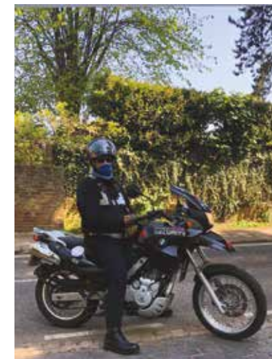
Triangle Security personnel provide a wide range of security services

SPECIAL OFFER ALARM RESPONSE £59.95 /month