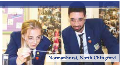
Normanhurst, North Chingford