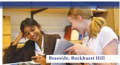
Braeside, Buckhurst Hill