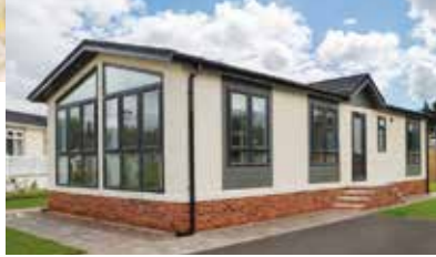
Move in ready homes available from £219,950

Friday, 14th - Saturday, 15th July | 10:00 - 16:00 Come and take a look around